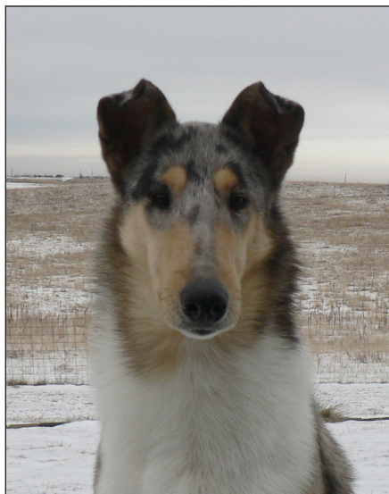
Ch. Cyndella's iCandy