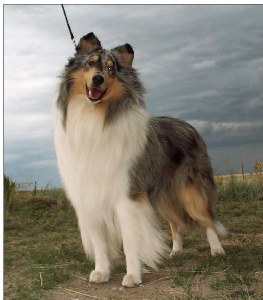
Above: Ch. Cyndella's Blue Moon Rising Below: Ch. Edenrock The Mask Of Society, ROM

Of Dreams, who would be the superstar. Following in his daddy's National-winning footsteps, Mason would win Best Opposite Sex to Best of Variety at the 2014 CCA in West Springfield. Mason is also the sire of 10 champions, including the 2011 CCA Best of Breed winner, GCh. Lonepine Who Knew.