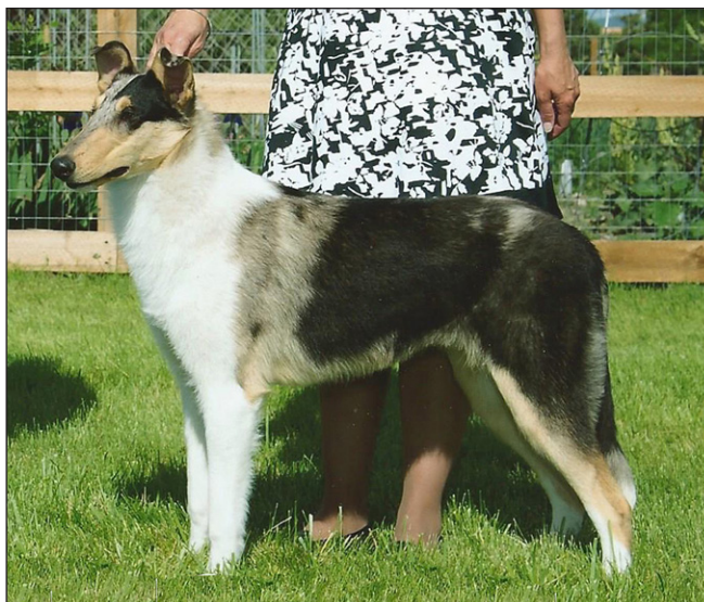
Ch. Cyndella's Farandole