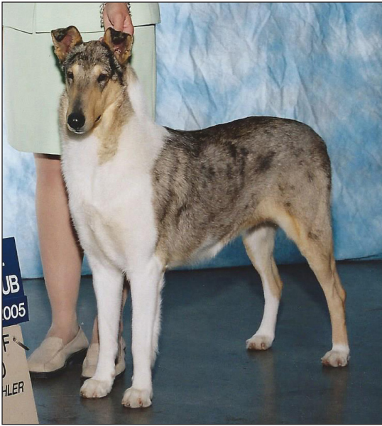
Ch. Lisara's Thrills Not Frills