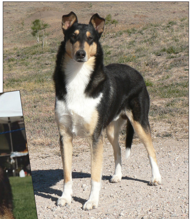
Ch. Cyndella's Triple Temptation (left) and Ch. Cyndella's Triple Shot (above)