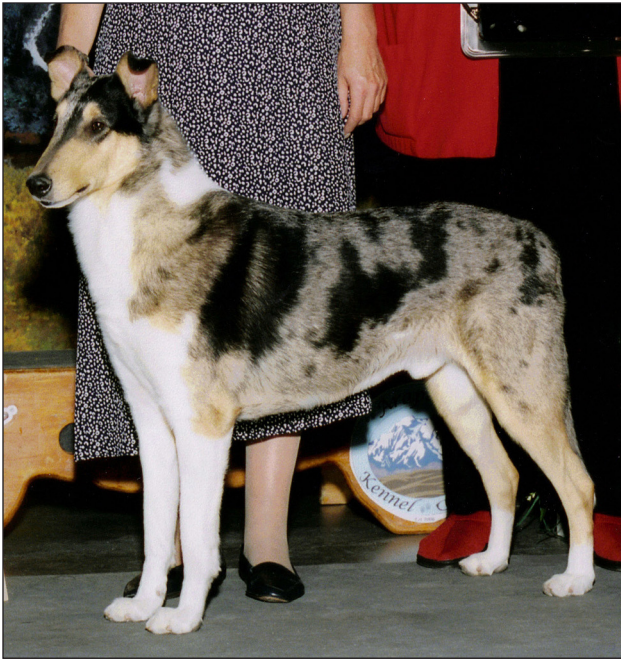
GCh. Cyndella's Splitting Image

I thank the breeders who believed in him; because of them, he was awarded the honor of Top Smooth Sire in 2011 ( Dogs in Review ) with seven champions finishing that year. Unfortunately, I was to have my heart broken when he was taken by cancer on March 12, 2010, at the young age of six-and-a-half. I still miss him to this day and find peace in knowing his spirit lives on through his offspring.