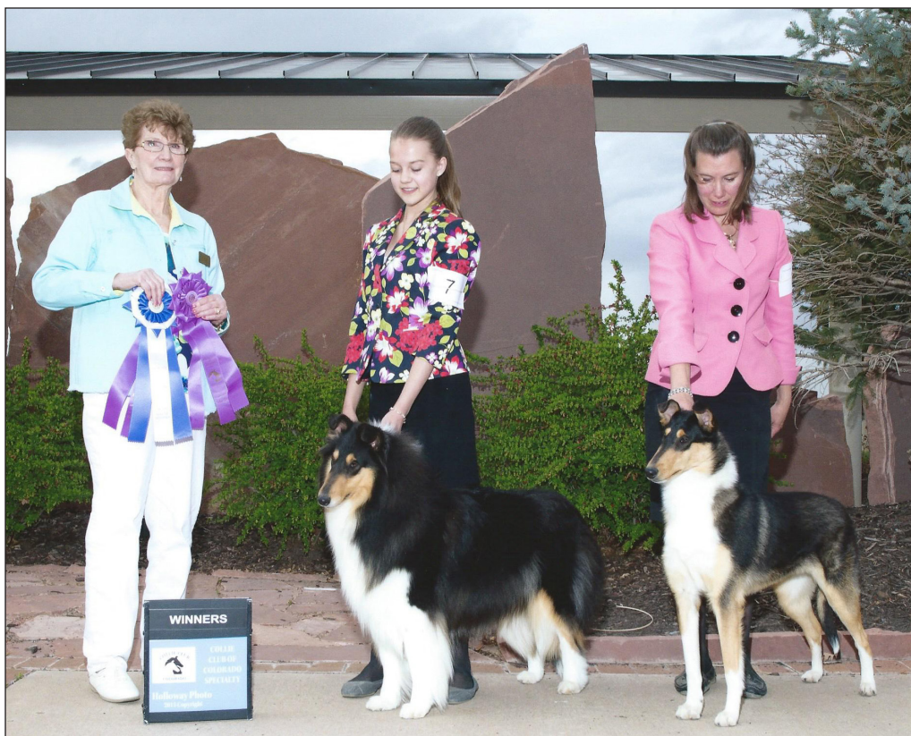
Ch. Cyndella's Dolled Up (Rough) and her daughter, GCh. Cyndella's I'm A Party Girl