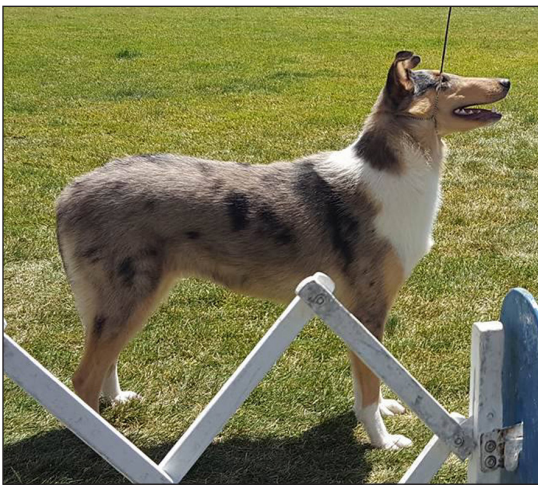
Ch. Cyndella's Fabulicious

In the two years following this litter Kylee would get a case of pyometra. With the help of my vet I did the prostaglandin treatment on her the first time, which was successful. I bred her the next season following treatment, to whom escapes me, as Kylee would pyo yet again. This time I spayed her. She lived out the rest of her years as a family dog, lying on the bed or couch. Basically, whatever Kylee wanted to do, she did. She would pass peacefully in my arms on June 10, 2015 at 13 years old.