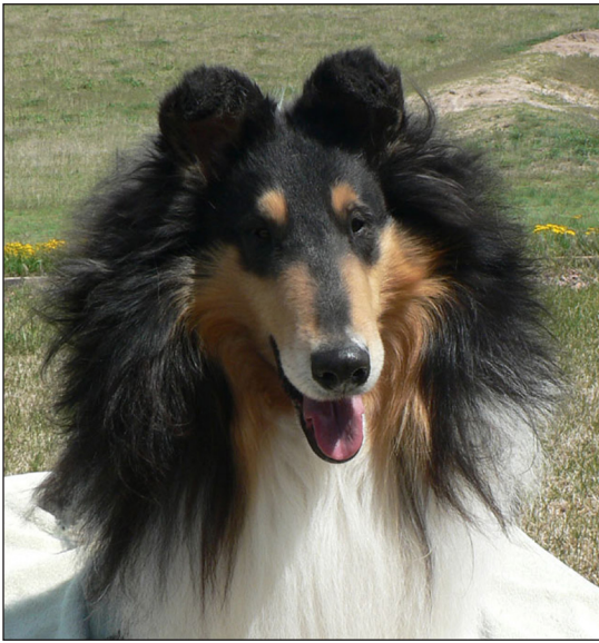
GCh. Cyndella's Pandamonium