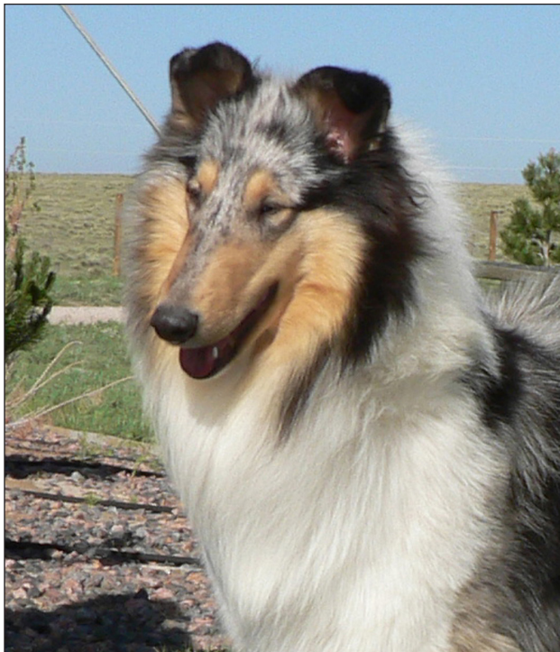
Cyndella's Triple De Lite

For her first litter, I bred her to Am/Can Ch. Tallywood Paradox, an outcross breeding. This breeding produced a champion singleton bitch, who then produced champions. However, after not getting what I was looking for I made the decision to not continue down this path.