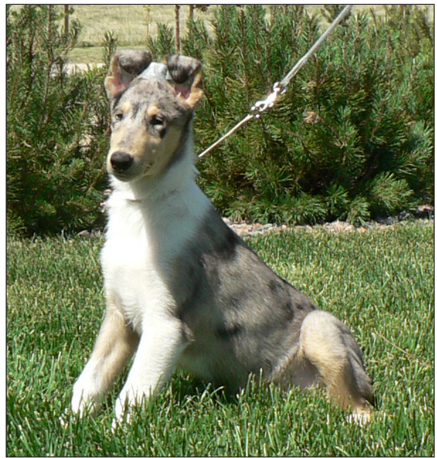
Ch. Cyndella's Pixy Stix at 12 Weeks