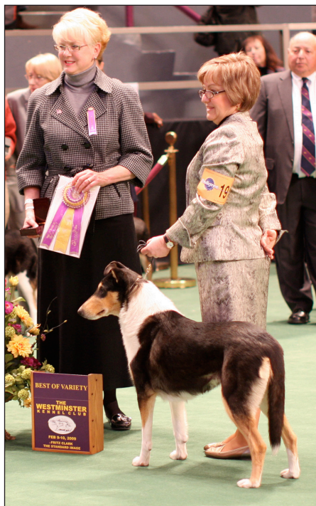
Left: Ch. Tango's She's Got The Look Below: Ch. Cyndella's Triple Shot