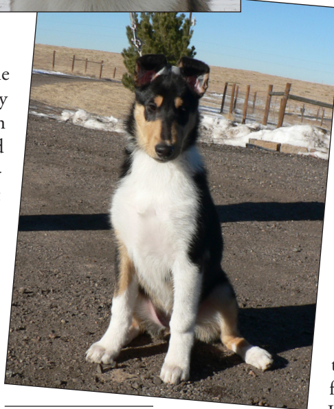
"Josie" GCh. Sealore's "A" List x Ch. Cyndella's Joi Ride