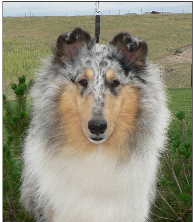
GCh. Cyndella's Miss July

After two litters, Madison went on to complete her championship with placements in the Open Blue and Brood